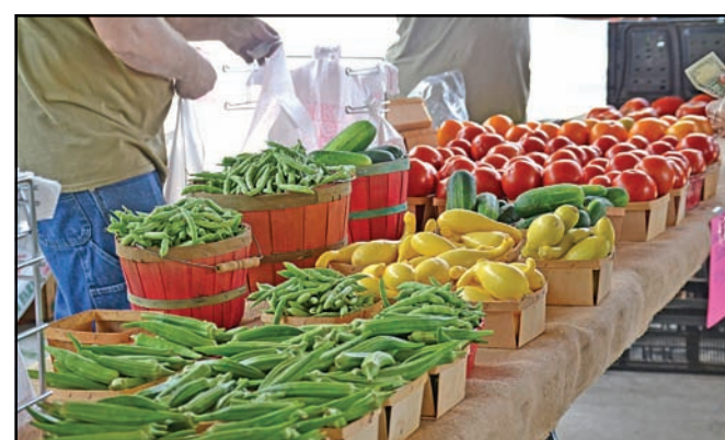
Produce is probably the hottest commodity during the Union County Farmers Market’s five-month season.

By Lily Avery North Georgia News Staff Writer